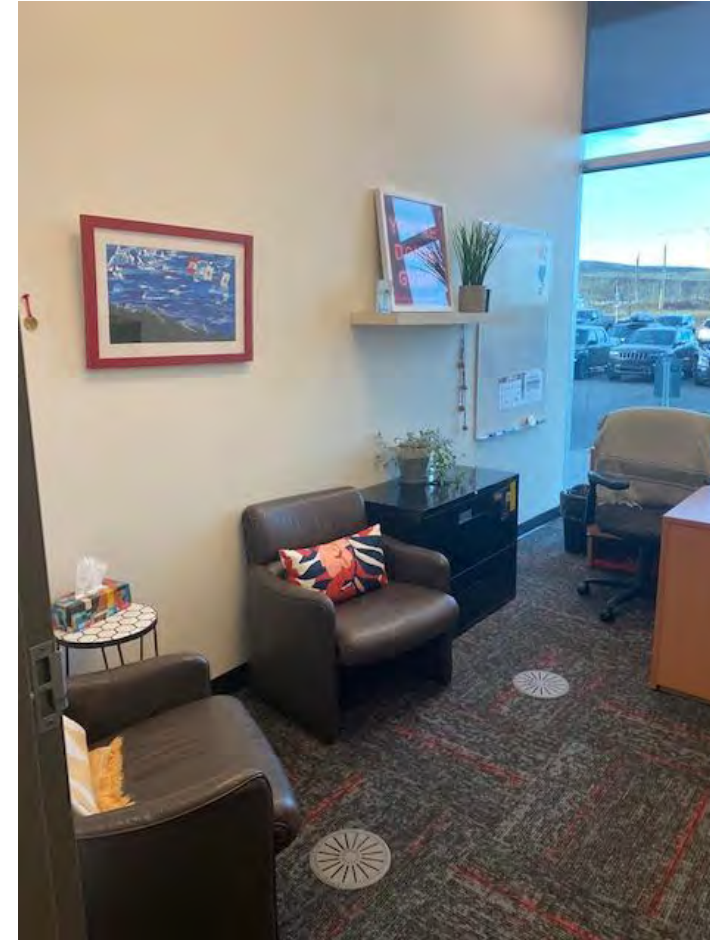
Meeting room for our consultant