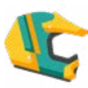
Full Face Helmet

Full-face helmets are required for Safari, Haircut Rabbit, Laserfade, and any black level trails in the skills center. Level 4 groups will advance throughout the week and may access these trails. Accessing these trails will require a full-face helmet and campers will be moved to a different group accessing different terrain if such a helmet is not provided or rented.