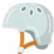
Half Shell Helmet