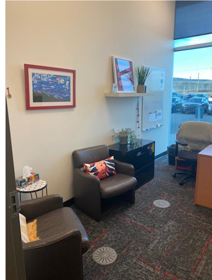
Meeting room for our consultant